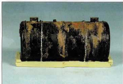
8 I used both methods on this boiler and this effect had developed after no more than an hour. If you're looking for precise effects you'll need to practice first.