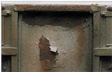
Left: By applying the rust first, masking it with Humbrol Maskol and then spray painting the model and peeling the masking off, the flaking paint and blistering can be created. Right: Close-up of rust and flaking paint on an 'O' gauge mineral wagon.

thus mix as much or as little as you need for the job in hand and the pack includes a pipette, mixing container and stirrer. There are also different ways of using the ingredients – you can either mix the rust and binder as shown in the pack instructions, or you can apply the milky-white binder on its own and sprinkle the rust powder onto it while it is still wet.