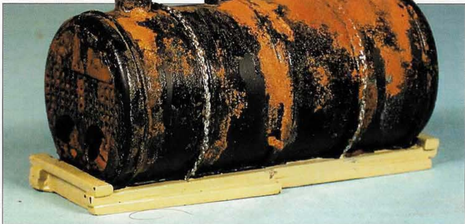
9 The previous view was taken at 5.30pm on Friday. This picture shows how the rust had developed by Monday morning, giving the full colour and richness.