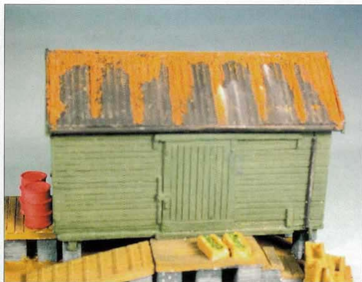
The roof of Townstreet's wooden shed was rusted with two coats of Scenic Rust to give this really unkempt appearance.